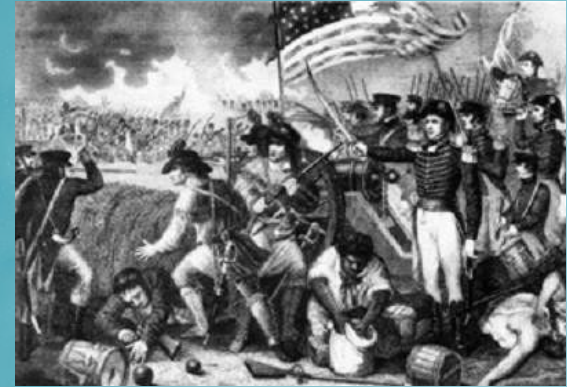
Tennessee Militia goes the credit

Tennessee militias served in battle again in the War of 1812 under Andrew Jackson. After fighting and winning the Battle of Horseshoe Bend (1814), they served with distinction in the Battle of New Orleans alongside other state militias, federal soldiers, local volunteers, slaves, and pirates against the British Army.